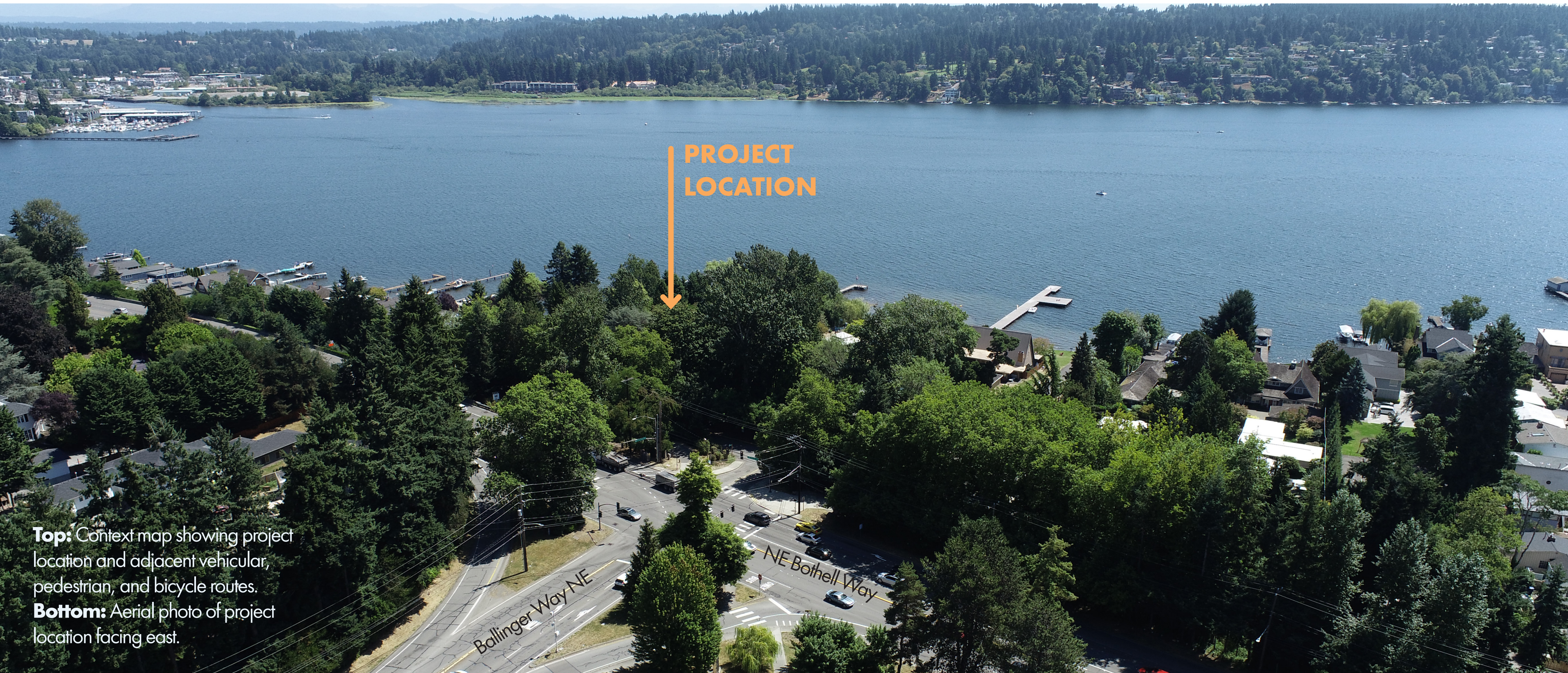
Top: Context map showing project location and adjacent vehicular, pedestrian, and bicycle routes. Bottom: Aerial photo of project location facing east.